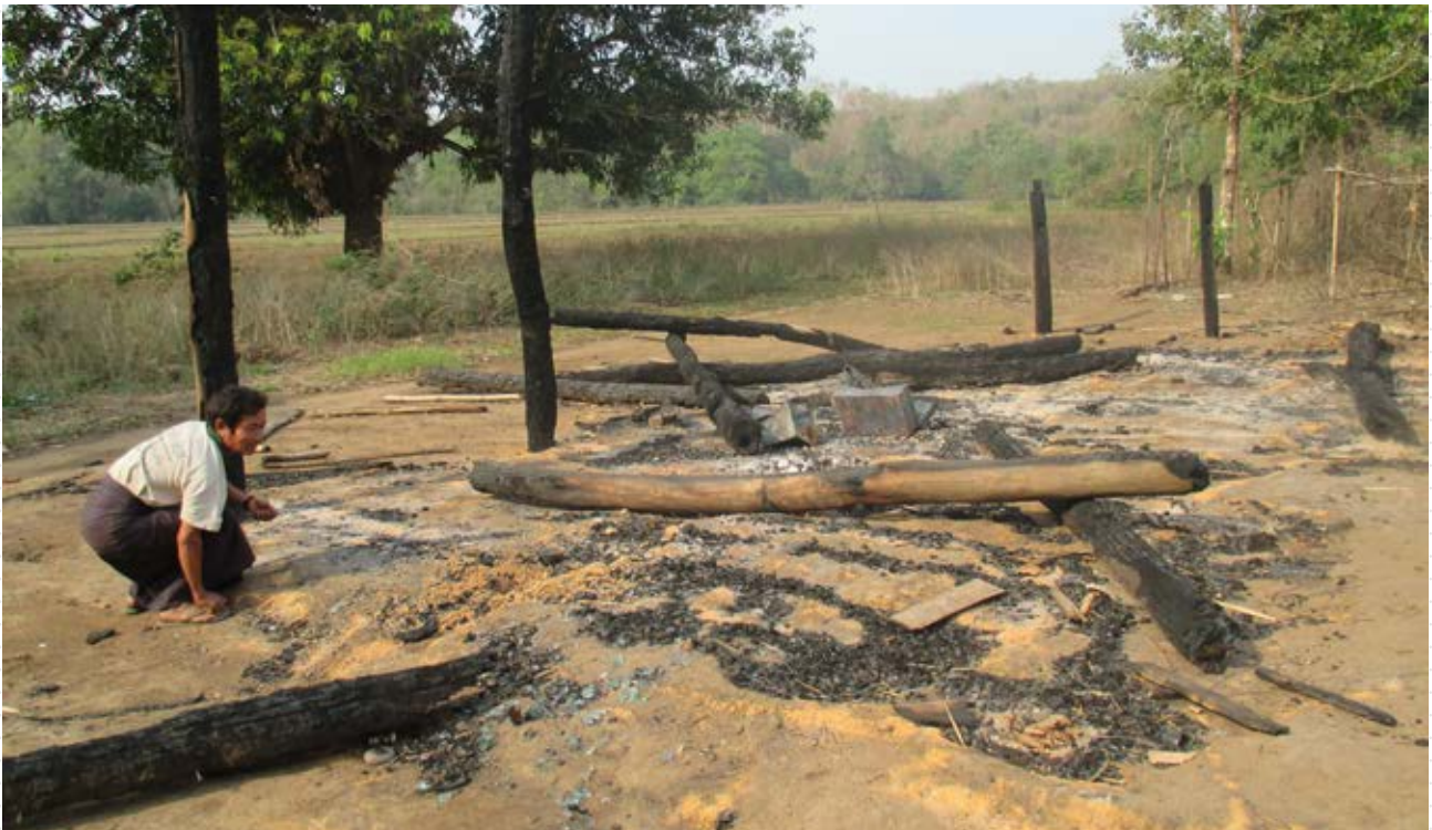
Man standing in front of the burnt down remains of his house in Tha Nay Moo village, following clashes between the Myanmar Army and the Democratic Karen Buddhist Army (DKBA).

Karen Human Rights Group (KHRG), Karen Environmental and Social Action Network (KESAN), Thwee Community Development Network (TCDN).