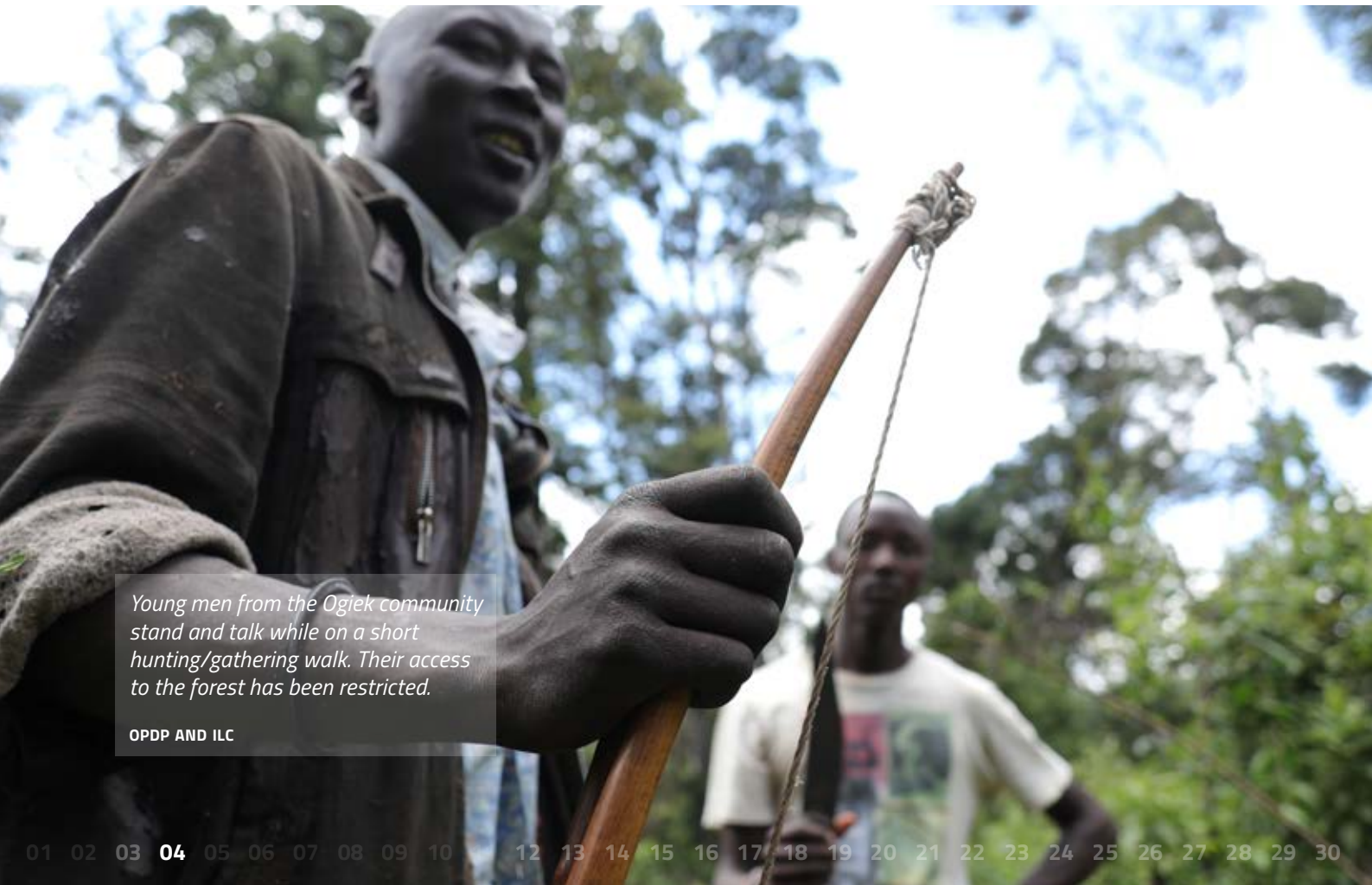
Young men from the Ogiek community stand and talk while on a short hunting/gathering walk. Their access to the forest has been restricted.

As we enter the 2019–2028 UN Decade of Family Farming, governments have the unique opportunity to secure indigenous and community land rights as a proven strategy to support local food systems and eradicate hunger. It is time for them to translate their international commitments into domestic laws and policies, allocate adequate budgets, and establish mechanisms for their implementation.