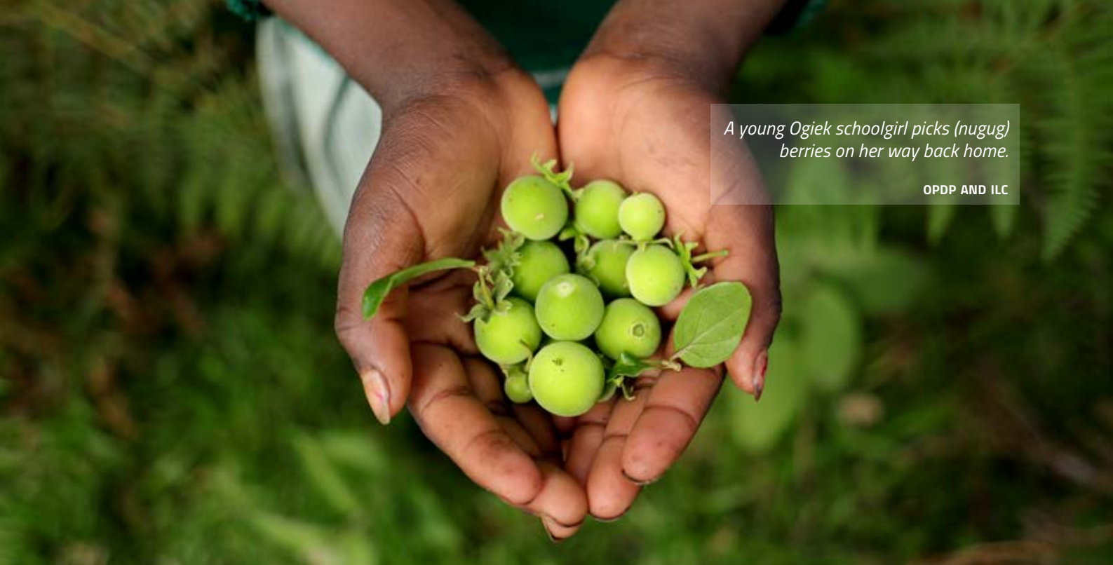
A young Ogiek schoolgirl picks (nugug) berries on her way back home.