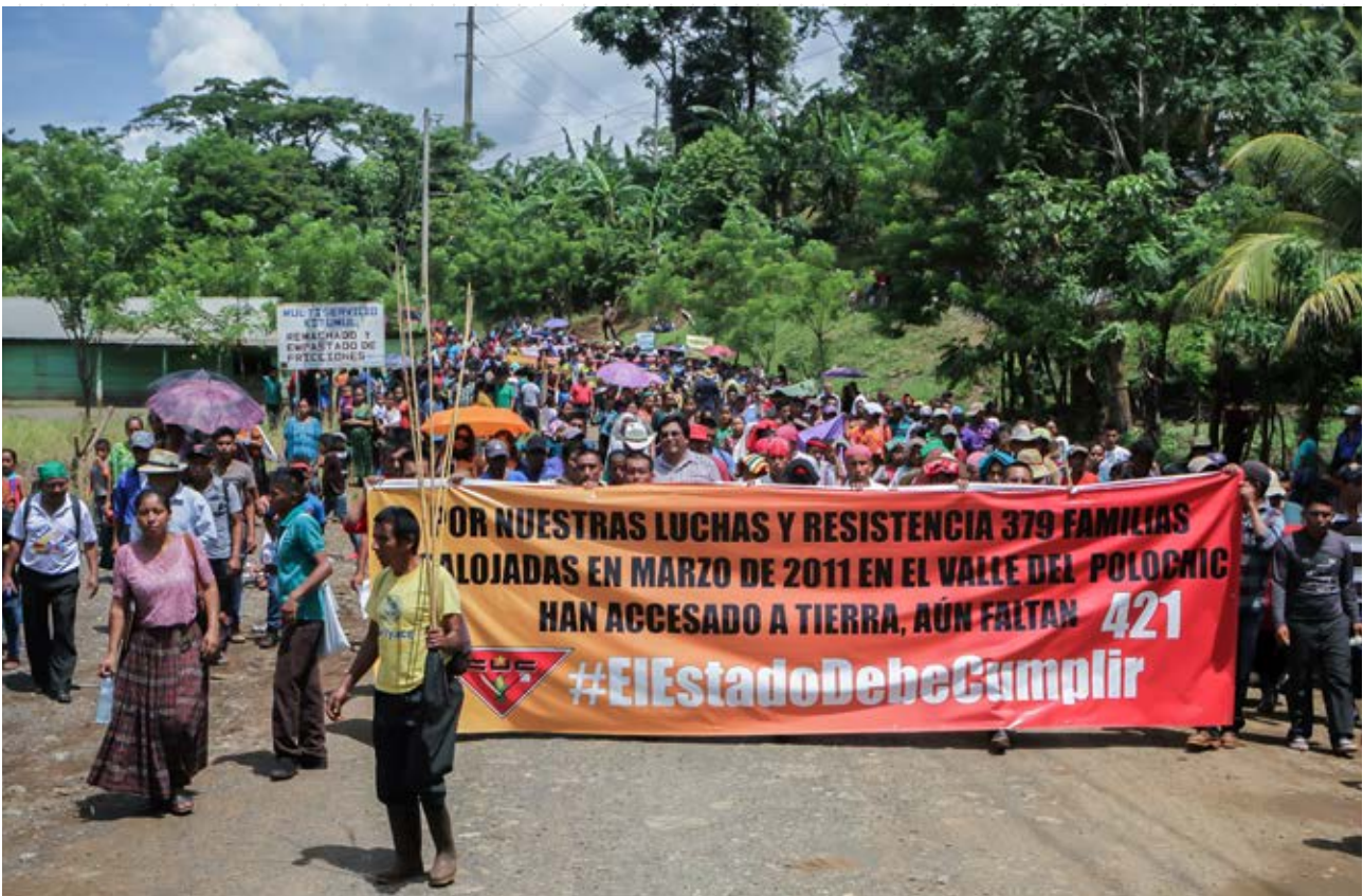
Momentum builds in the fight against evictions in Guatemala: Making us all a bit braver Polochic Case

Oxfam, Action Aid, Comité de Unidad Campesina CUC.